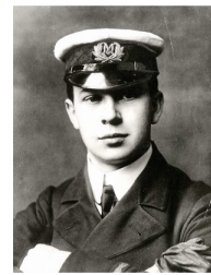
Jack Phillips: Titanic's Chief Wireless Telegraphist